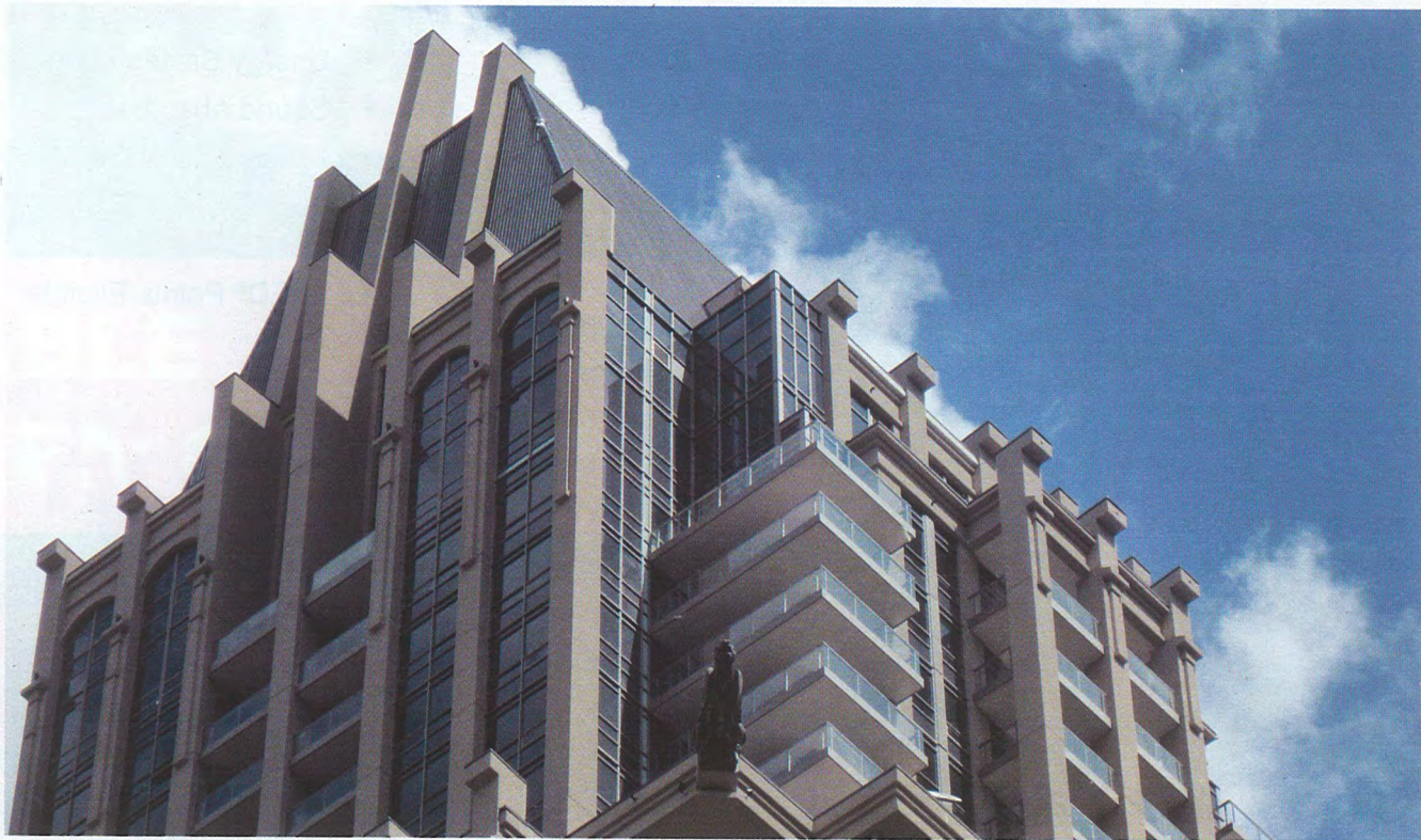
One Park Tower, a 38-storey condominium in Mississauga, Ontario.

Durabond Products Ltd. offers several EIFS products, the most common of which are Durex Quantum Select, Durex EW-17 Select and Durex Flexlite Select