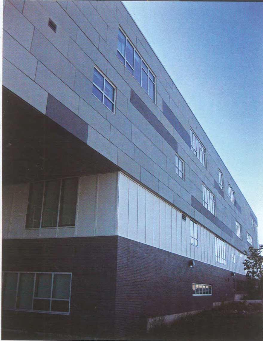
Forest Manor Public School, Toronto, Ontario.