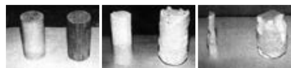
Before Immersion After 5 Weeks After 10 Weeks

IWATE University Technical Report, “Resistance to Acid Attack”, Tokyo, Japan