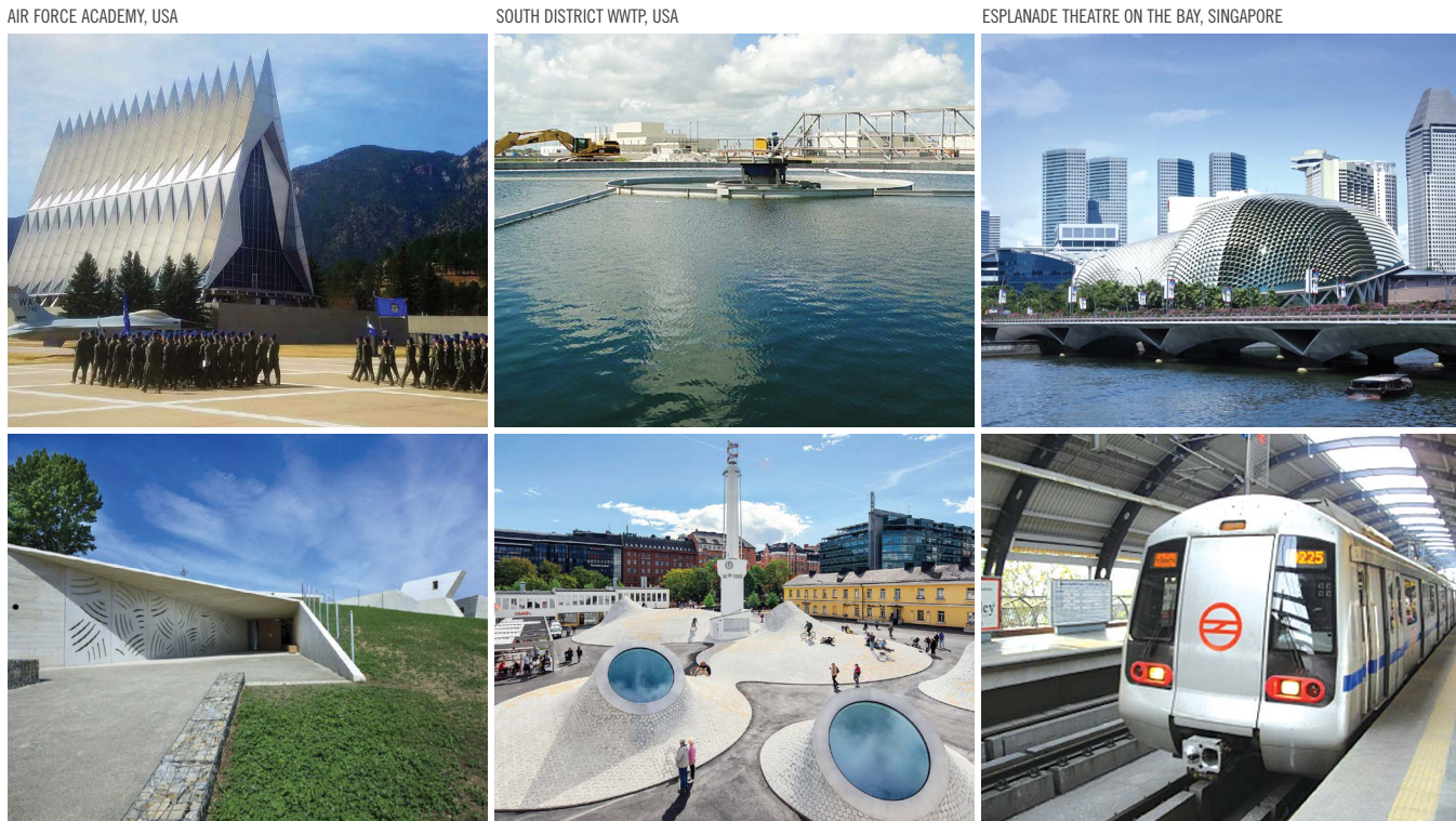
PAVLOV ARCHEOLOGICAL PARK, CZECH REPUBLIC