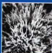
Xypex Crystallization (Mature)

XYPEX integral crystalline technology waterproofs concrete foundation structures as they're poured and cannot be damaged during installation or backfilling. Unlike membranes, Xypex is added to the concrete at the time of batching avoiding application errors. This sustainable technology also contributes to LEED credits.