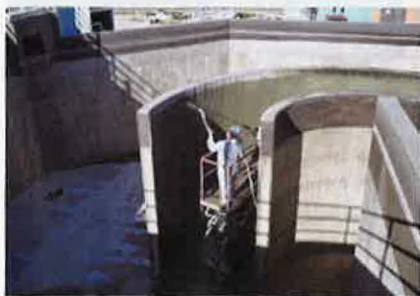
Crystalline waterproofing can increase concrete durability and decrease environmental impact.

with Crystalline Technology" course is available at https://continuingeducation.bnppmedia.com . The course qualifies for 1 AIA LU/HSW credit and 0.1 ACET CEU and may also qualify for Professional Development Hours. ♦