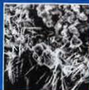
Xypex Crystallization (Initiated)