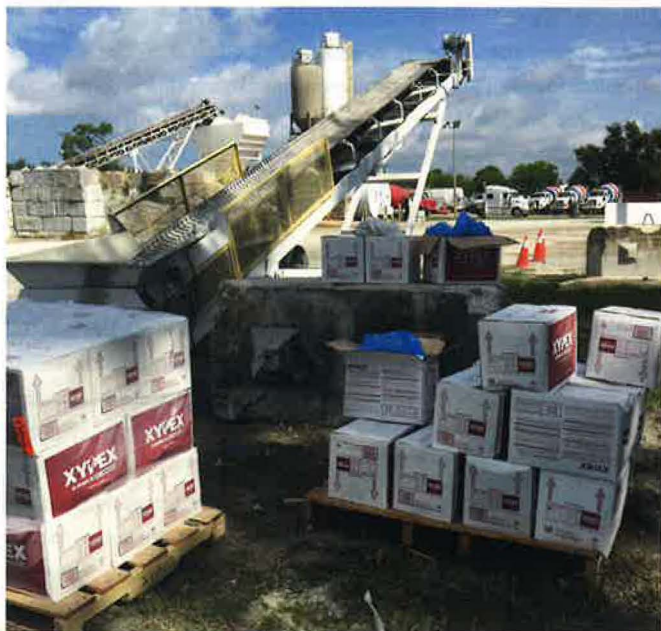
Xypex admixture at Miller Pump Station concrete batch plant.

the positive or negative side of a concrete structure or used as an admixture during the batching of the concrete mix. WW