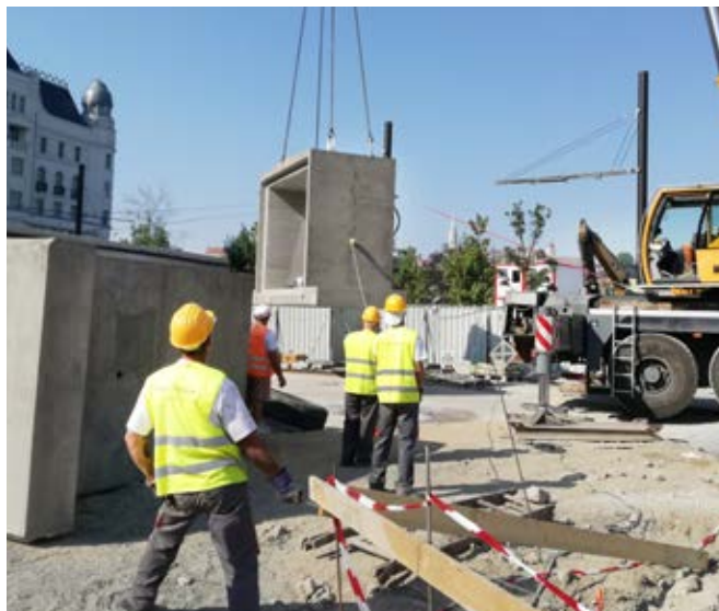
Precast sections and their installation