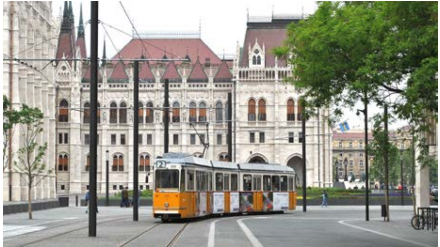
Street car line running over top of the tunnel

The design team settled on the use of both cast-in-place and precast sections to create the tunnel. Precast was used below the road surface itself to speed construction and thus reduce the time that the full road surface was closed. Both parts of the tunnel had similar dimensions utilizing 20 cm (8 inch) thick walls and ceiling with a 40 cm (16 inch) thick base slab. The base slab was thickened to support the tunnel and overhead loads as well as to provide ballast to keep the tunnel from floating in the high water table environment.