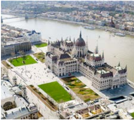
Aerial view of Parliament Building situated on the Danube River with the offices across the street