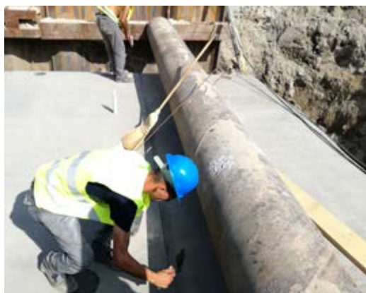
Precast joint waterproofing systems and their installation

The conclusion of the project is a bright, dry and comfortable pedestrian tunnel between these two buildings that was constructed and waterproofed against ongoing hydrostatic conditions.