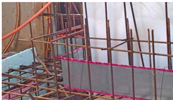
Cast in place walls being formed with typical joint waterstop detail to left