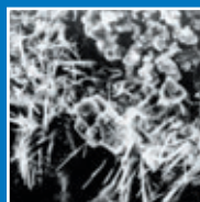
Xypex Crystallization (Initiated)