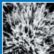
Xypex Crystallization (Mature)

Buried precast concrete products are susceptible to water infiltration and concrete deterioration. Manholes and septic tanks are especially vulnerable to sulfate and acid attack caused by microbial induced corrosion. Xypex Admix provides a unique solution to these problems. When added to the concrete mix, it provides integral waterproofing as well as increased acid resistance and sulfate protection. When you select Xypex you've chosen the best – more than 40 years of independent testing and still No Equal .