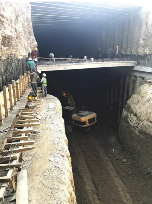
Xypex crystalline waterproofing protects a wastewater channel that runs along a new double tunnel underpass in Mexico City.

The recently completed Mixcoac-Insurgentes underpass interchange is the first double tunnel system constructed in Mexico City. It spans over 1.3 km, with one tunnel roadway over the other, creating some significant architectural and structural challenges, including the need to protect existing infrastructure.