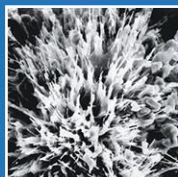
Xypex Crystallization (Mature)

XYPEX integral crystalline technology waterproofs concrete foundation structures as they're poured and cannot be damaged during installation or backfilling. Unlike membranes, Xypex is added to the concrete at the time of batching avoiding application errors. This sustainable technology also contributes to LEED credits. When you select Xypex Crystalline Technology , you've chosen the best... more than 40 years of independent testing, experience in over 90 countries, unmatched product and service standards ... and still no equal.