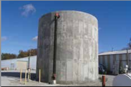
Red Bud, Illinois, USA