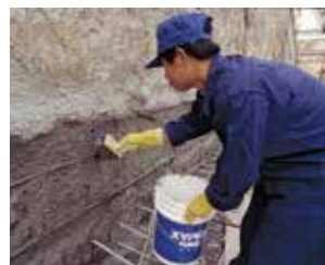
Coating Concentrate & Modified