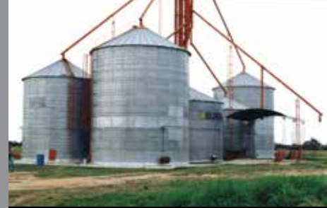
Calafate S.A. Cereal Storage Silos, Argentina