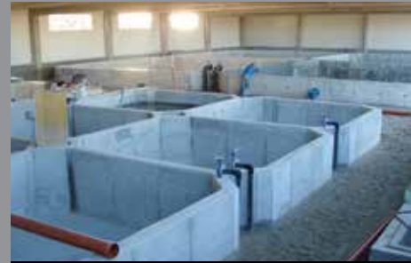
Akazto Fishery, Hungary