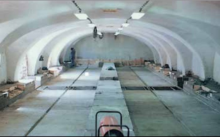
Podlesice Animal Barn, Czech Republic