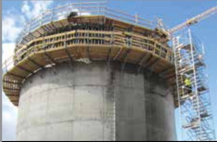
Tartu Biogas Plant, Estonia